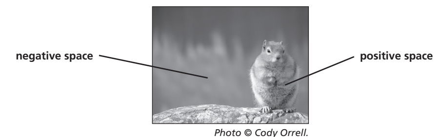
The softness of the negative space in this photo contrasts with the sharp lines of the rock and the squirrel's fur.

Space: The emptiness or open area between, around, above, below, or within objects. Shapes and forms are defined by the space around and within them. Conversely, spaces are defined by the shapes and forms around and within them.