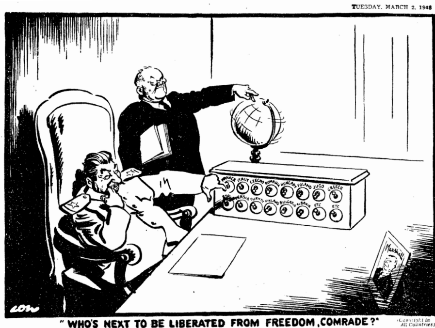
"Who's Next to be Liberated from Freedom, Comrade?," cartoon by David Low. First published in the Evening Standard , March 2, 1948.

Analyze the political cartoon below by answering the questions that follow in your history notebook.